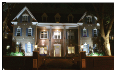
Lil' Tara glowing in the night

Knox and 28th straight Sisson! Looking ahead to a few dates, we welcome all Alumni back to Lil' Tara for any football